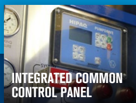
INTEGRATED COMMON CONTROL PANEL