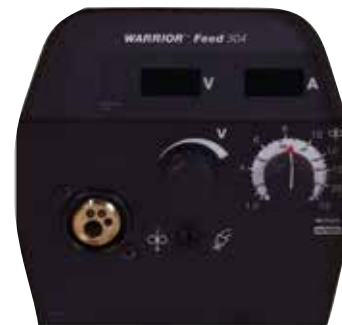
Warrior Feed 304 Front Panel

Warrior 500i can be paralleled to utilize larger gouging rods.